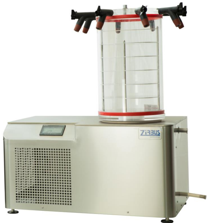
Vaco 5 With acrylic drying chamber, inner rack and connections for round flasks