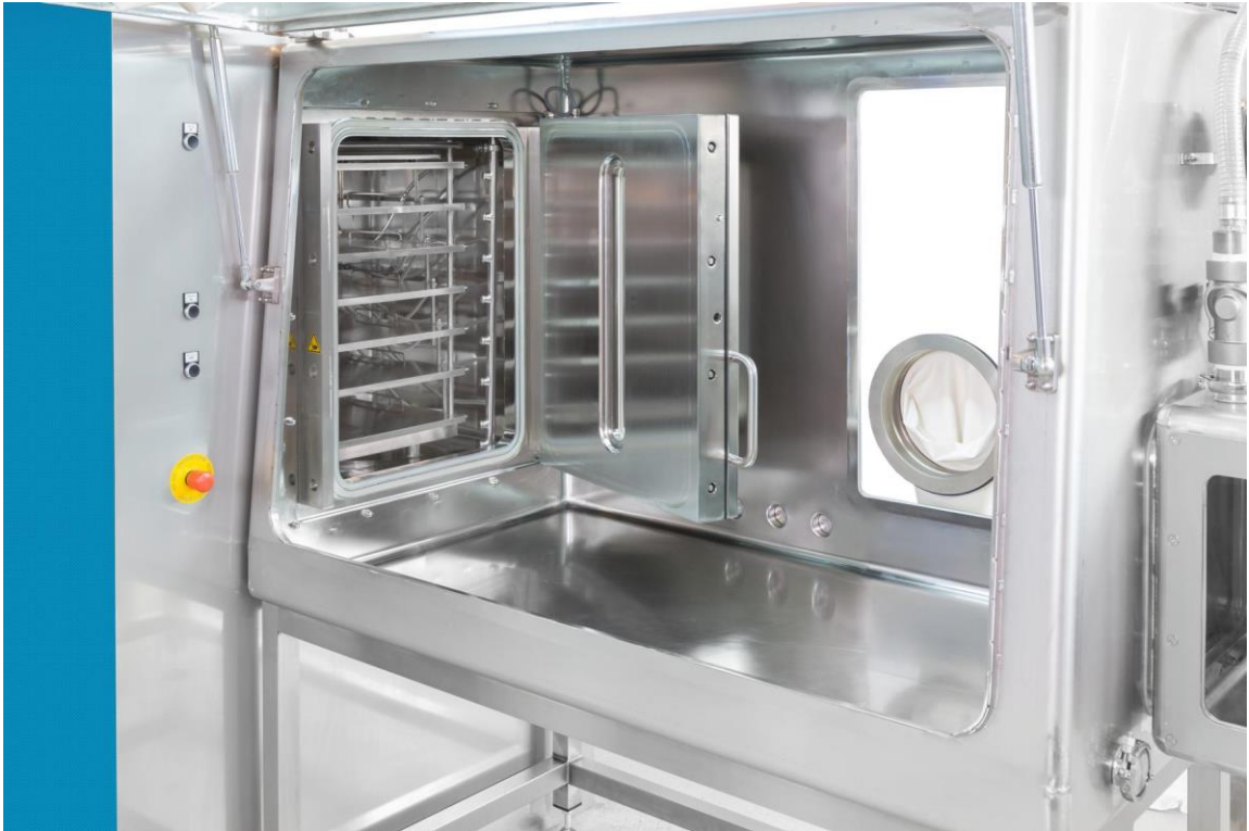
Freeze dryer <-> Isolator Adaption