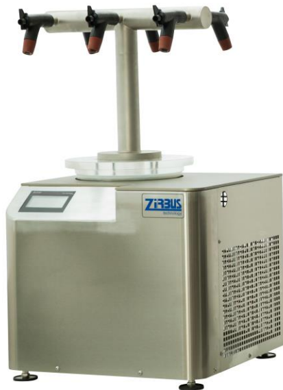
Vaco 2 6 port Manifold

2, 5 and 10kg condensers for laboratory devices